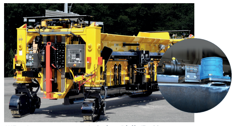
SHE series worm gear screw jacks from Pfaff-silberblau ensure reliable operation in the latest screeds of a global mechanical engineering company.