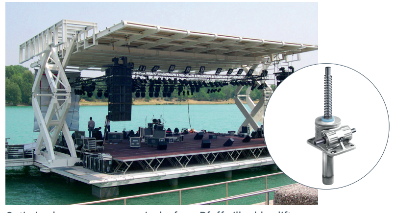
Optimized worm gear screw jacks from Pfaff-silberblau lift and lower the roof of Milan's stage reliably and, above all, safely.